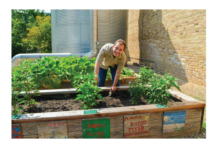
RADIO FLYER'S "ECO-FLYERS" COMMITTEE PLANTS THEIR LITTLE GREEN GARDEN TO PROVIDE FRESH VEGGIES TO FLYERS YEAR-ROUND.