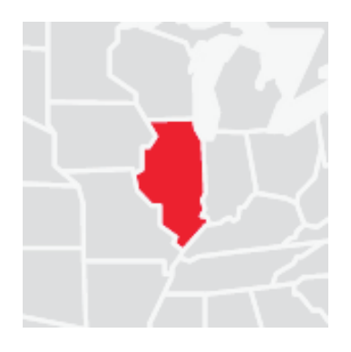
Chicago, IL, US