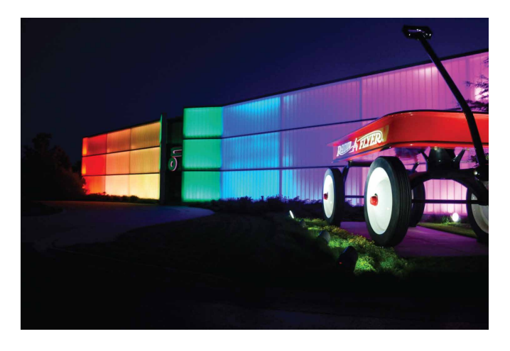
RADIO FLYER ADORNED THEIR BUILDING WITH RAINBOW LIGHTS DURING PRIDE MONTH TO SHOW SUPPORT FOR THE LGBTQ+ COMMUNITY.