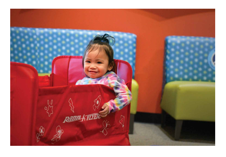
RADIO FLYER'S HERO WAGON IS DESIGNED FOR HOSPITALS, MADE OF EASY-TO-SANI-TIZE MEDICAL FABRIC TO TRANSPORT LITTLE RIDERS.