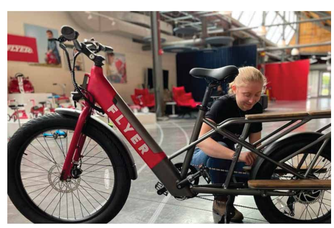
RADIO FLYER LAUNCHED THE FLYER ^{\rm TM} LINE OF EBIKES AND ESCOOTERS FOR ADULTS IN JUNE 2021.